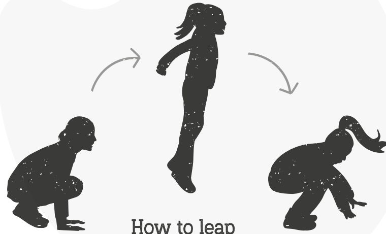
How to leap like a frog